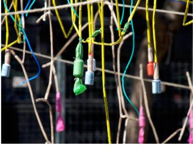
EXPAT LIFE - APRIL 7, 2020 - 8 MINS READ

19 Signs You've Been Living In Valencia For Too Long