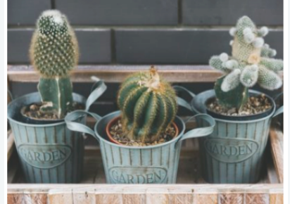
HOME & GARDEN - APRIL 24, 2020 - 6 MINS READ

Rustic Italian Restaurant In Valencia - San Tommaso