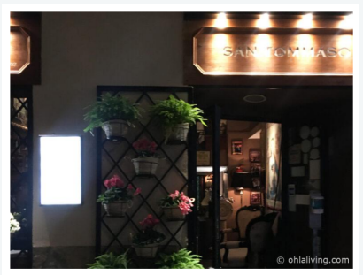
VALENCIA - OCTOBER 10, 2020 - 6 MINS READ

Rustic Italian Restaurant In Valencia - San Tommaso