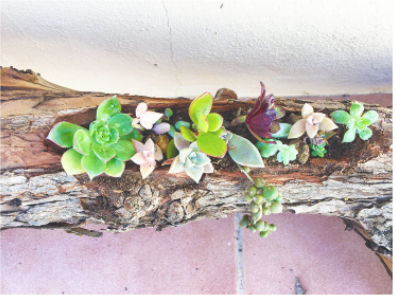
HOME & GARDEN - APRIL 15, 2020 - 6 MINS READ

'It's Life, Jim, But Not As We Know It' - Day 40 of Isolation: