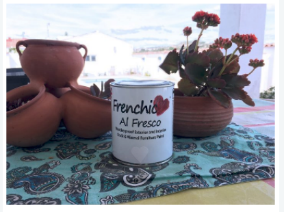
HOME & GARDEN - MARCH 8, 2020 - 7 MINS READ

Online Plant Shops In Spain To Satisfy Your Green Fingers