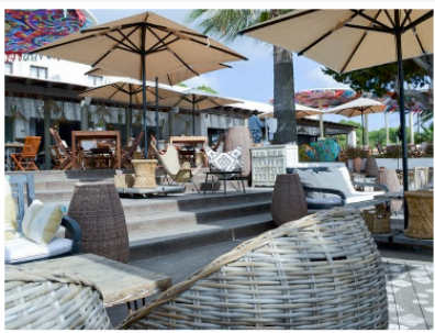
DECEMBER 4, 2017 - 5 MINS READ Anniversary: Part Three: Aiyanna Ibiza & Restaurante Port Balansat

Anniversary: Part One: Staying At Aguas De Ibiza